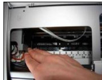
Make sure the length of tubeline is enough to reach the far left and right