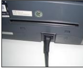
Instert the plug