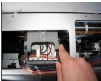
Adjust the tubeline, remove the Cartridge-car back and forth