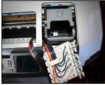
Remove the cartridge-car back to right