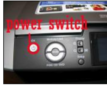
Turn on the power switch check wether all thing is usual