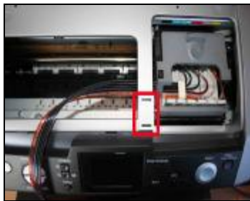
Attached the clamp on printer's Cover tightly