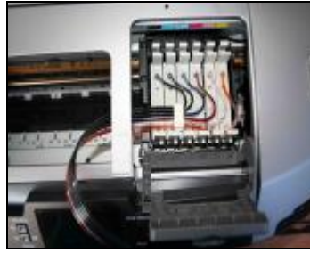
Put the cis cartridge into printer