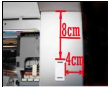
Attached another clamp like the picture shown 8cm far from the top side, 4cm far from the right side