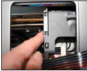
Move the cartridge-car to right side