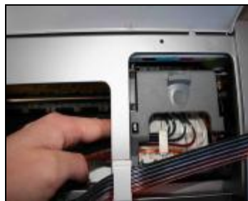
Make sure tubeline will not meet printer when printing