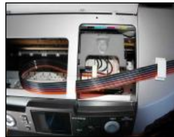
Insert the tubeline into tube-holder