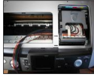
Close the cartridge-cover